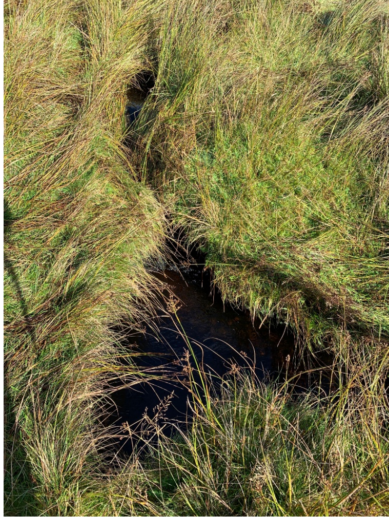
Figure 5: Site 4, Small Burn, upstream of confluence