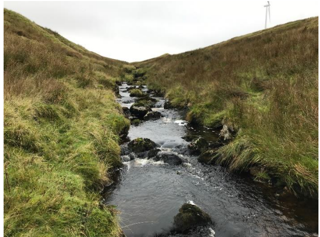
Site 4 – Afton Water