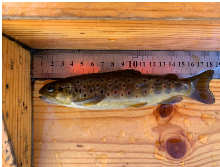
Figure 2: Trout parr caught in site 1