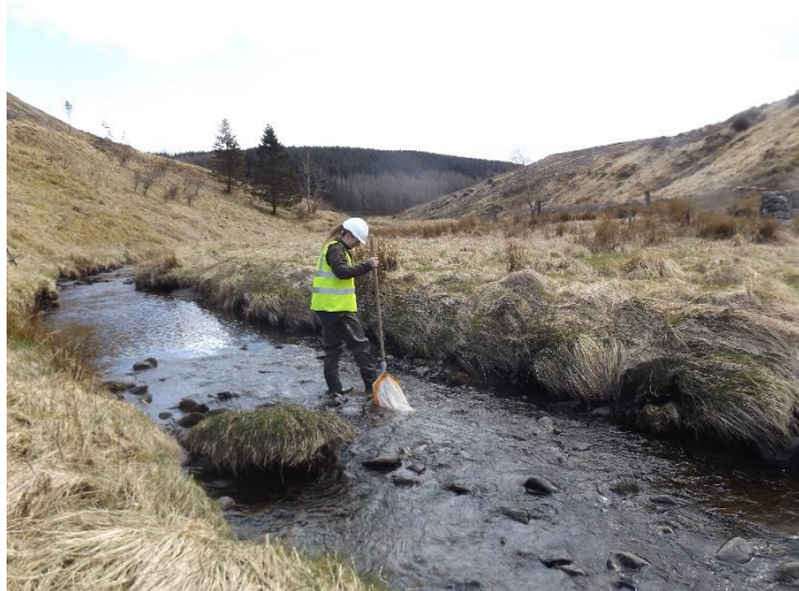
Figure 3 – Kick sampling for aquatic invertebrates