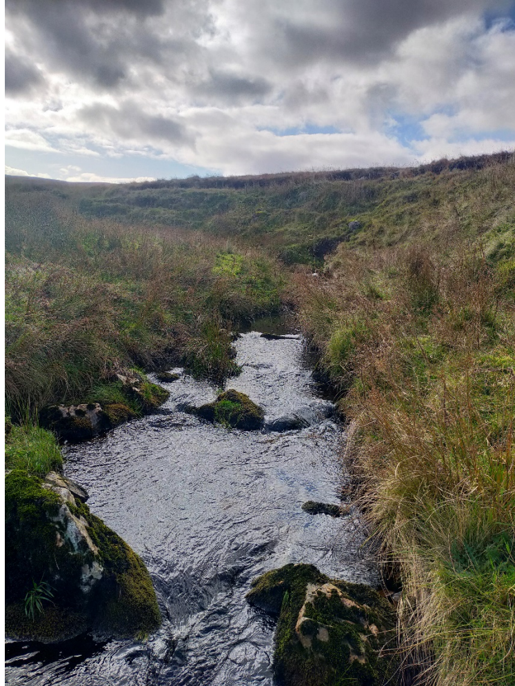
Figure 7: Site 6, Pulmulloch Burn