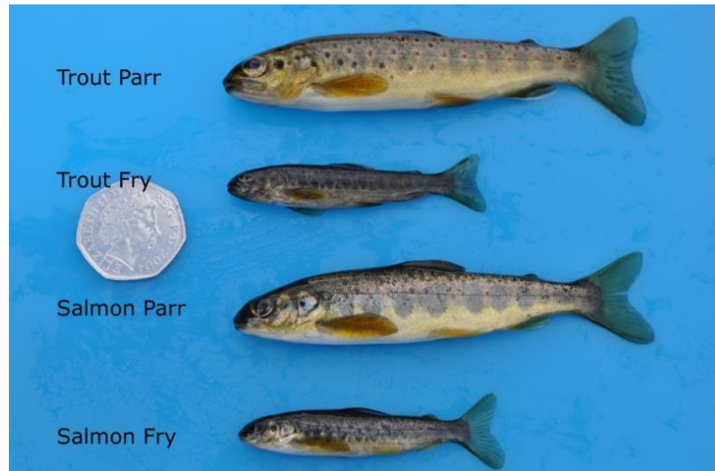
Figure 2 - Salmonids: Salmon and Trout, Parr and Fry