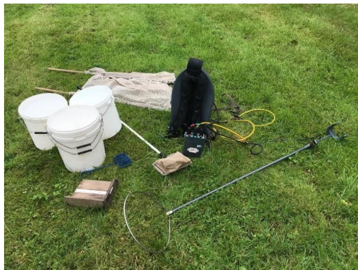
Figure 1 – Backpack electrofishing equipment and associated equipment

One banner net was employed where appropriate, and dip nets with 1.3 metre handles attached were used to capture stunned fish which were placed into a water-filled bucket to recover.