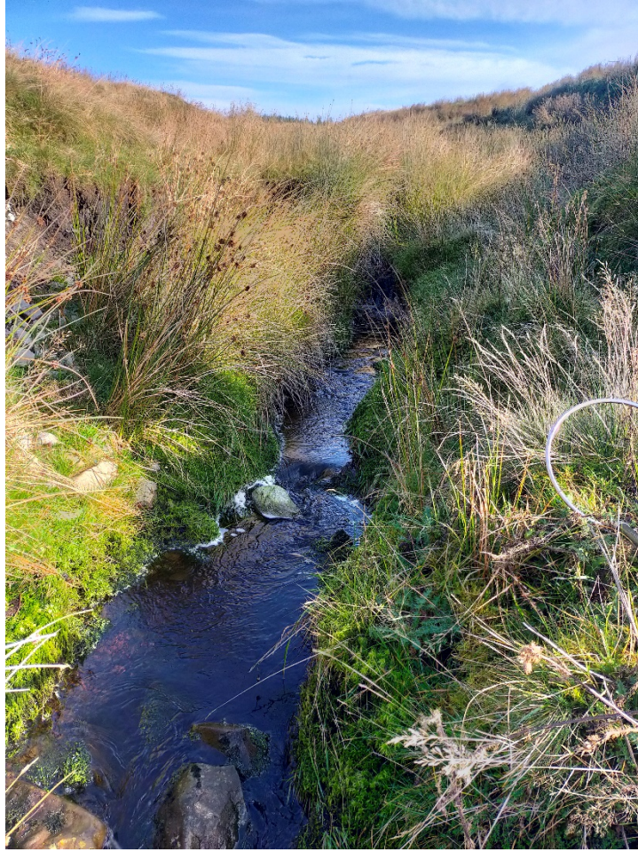
Figure 8: Site 7, tributary of the Pulmulloch Burn at High Countam