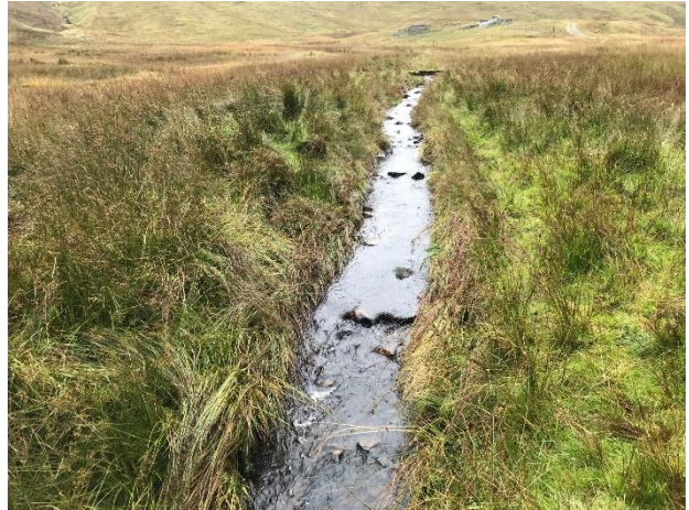
Site 2 – Alwhat Burn