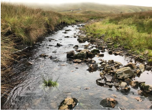
Site 3 – Afton Water