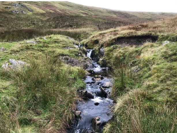
Site 5 – Alwhat Burn