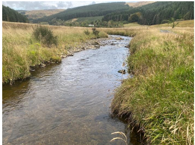
Site 6 – Dalwhat Water