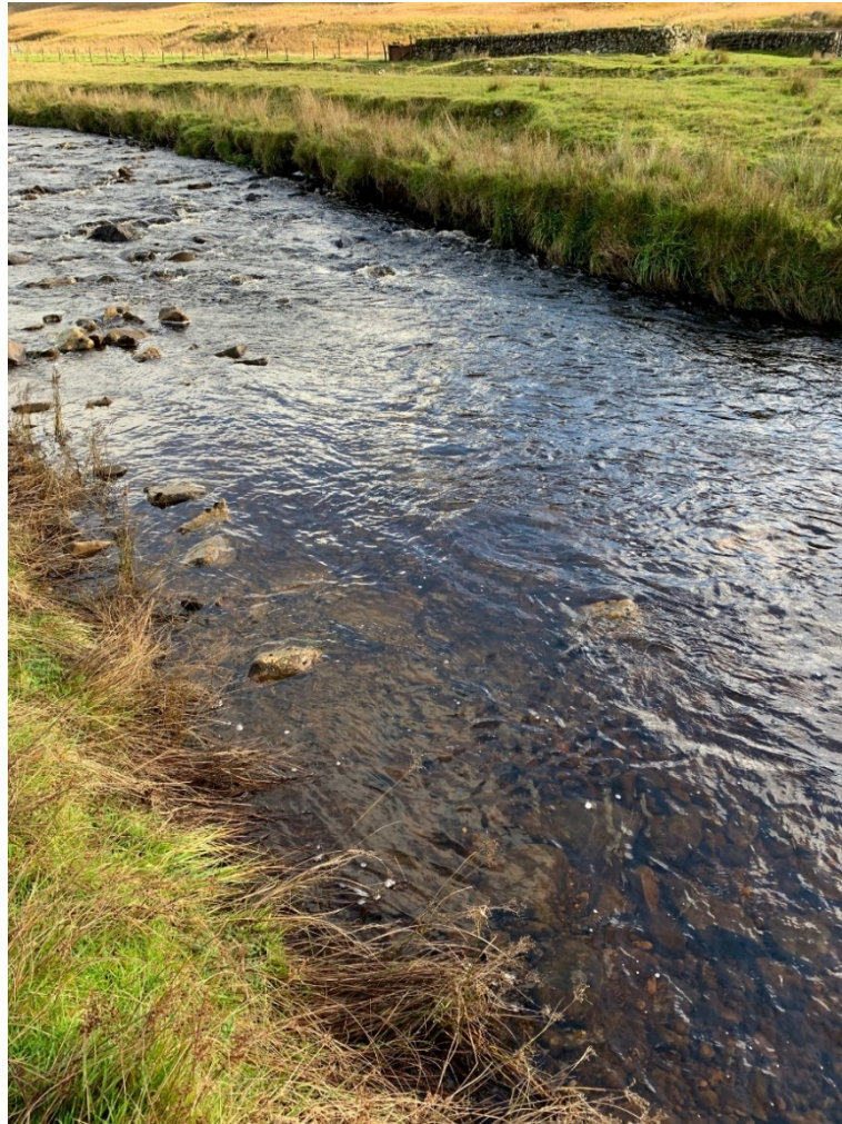
Figure 1: Site 1, upstream of the ford

Both Brown trout fry and parr were found in low densities in this site, ranging from 0+ years all the way to 3+ years (Figure 2).