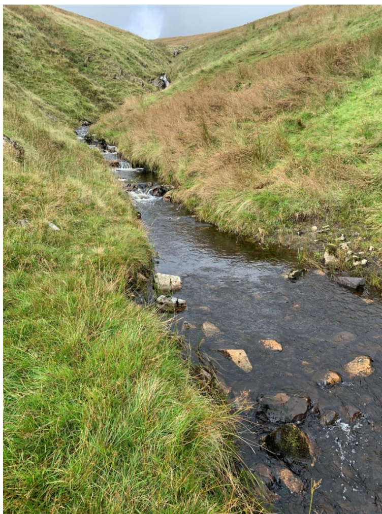
Figure 3: Site 2, Un-named tributary of the Alwhat Burn