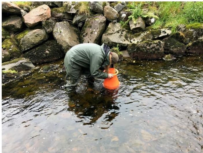
Figure 3 – Surveying for Freshwater Pearl Mussels using a bathyscope

Following the initial survey in the area directly downstream from the predetermined survey site, the FWPM survey was extended to 100m upstream and 500m downstream. This extended survey identified FWPM habitat which was then visually inspected for their presence. Any FWPM found during the extended search would then result in a 50m transect being subject to a more detailed survey, as per the protocol.