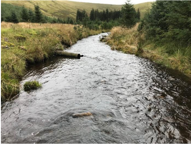
Site 1 – Afton Water