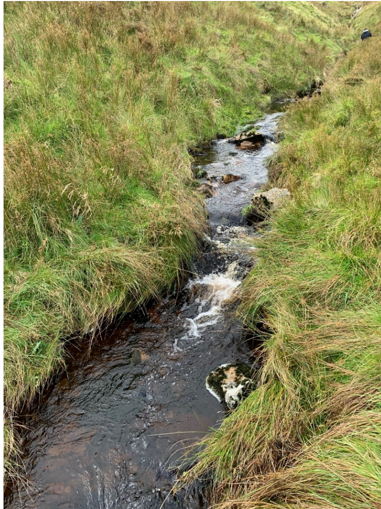
Figure 4: Site 3, upper Alwhat Burn, Water of Ken