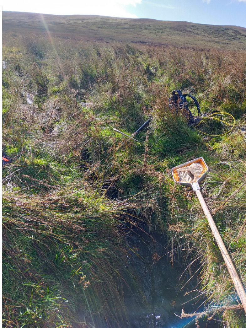
Figure 6: Site 5, Pulmulloch Burn