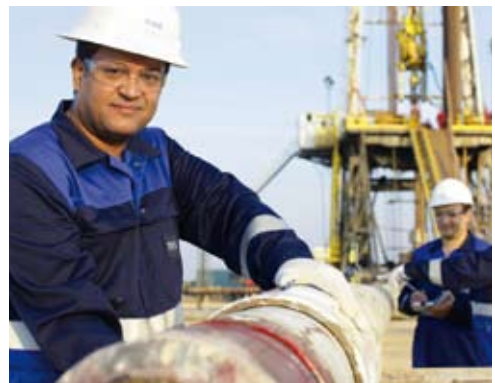
RWE Dea's activities in Egypt: Exploration and production of natural gas and crude oil.