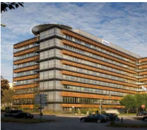
RWE Dea is headquartered in Hamburg, Germany.

RWE Dea has been involved in exploration and production projects in Egypt since 1974. Since 2000, RWE Dea has set out to strengthen and expand its position in Egypt as one of its core regions and to create a strong and reliable platform for a growing