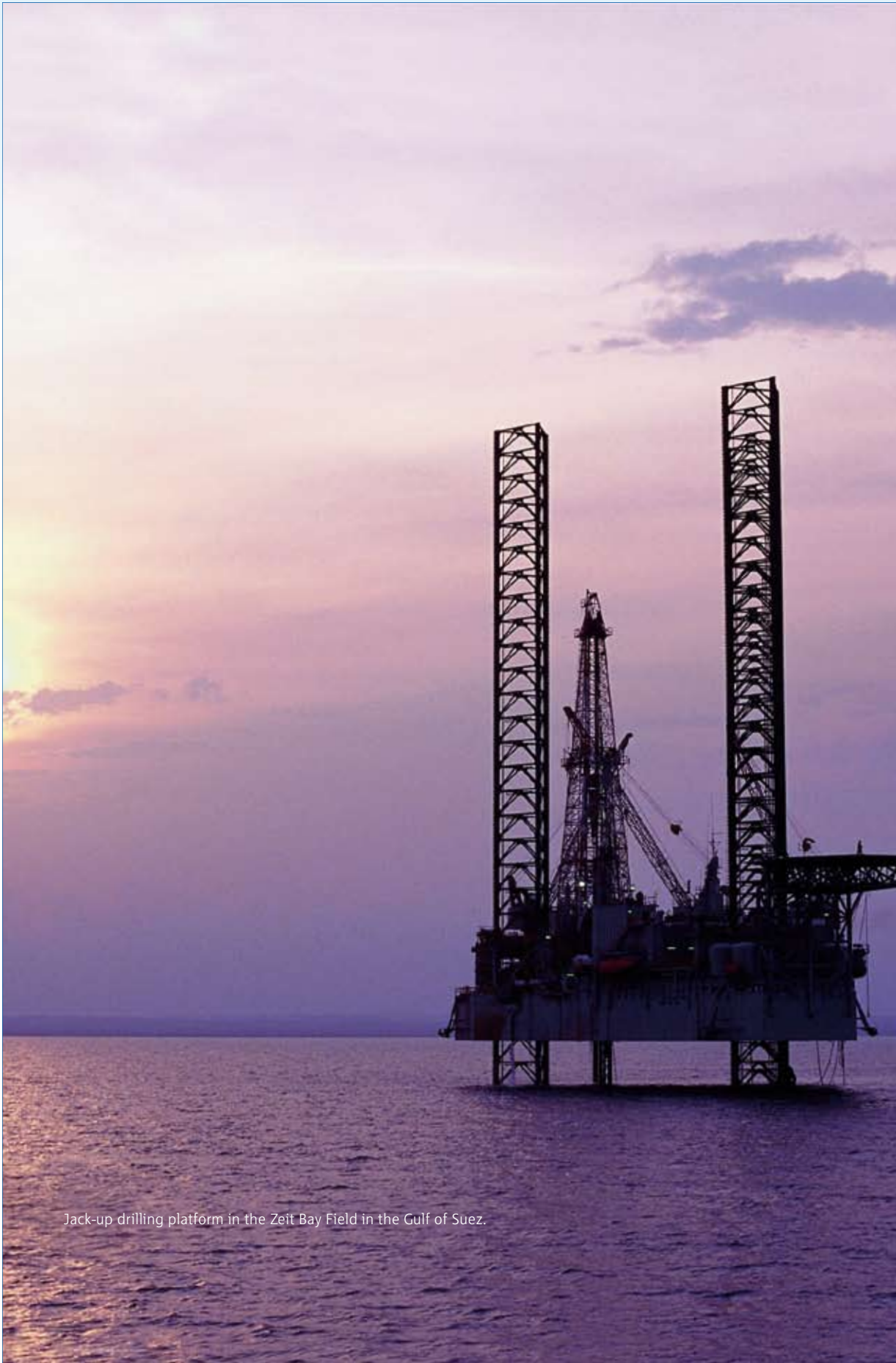
Jack-up drilling platform in the Zeit Bay Field in the Gulf of Suez.