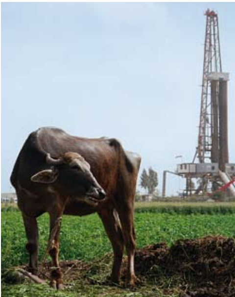
Exploration in the West Nile Delta.

The environmentally sensitive areas in the onshore and offshore Nile Delta requires special attention. RWE Dea is bringing