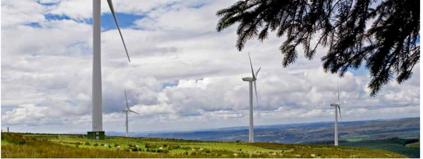
Ffynnon Oer Wind Farm near Neath, South Wales. Constructed by RWE npower renewables in 2006. Photographs of existing operational wind farms within this newsletter are not intended to represent the appearance of the proposed Clocaenog Forest Wind Farm.