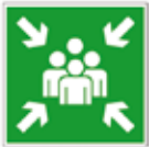
Emergency muster station