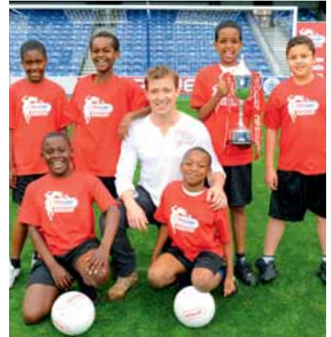
TV presenter Ben Shephard at the Kids Cup launch