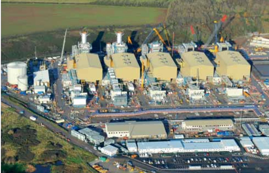
View of Pembroke Power Station