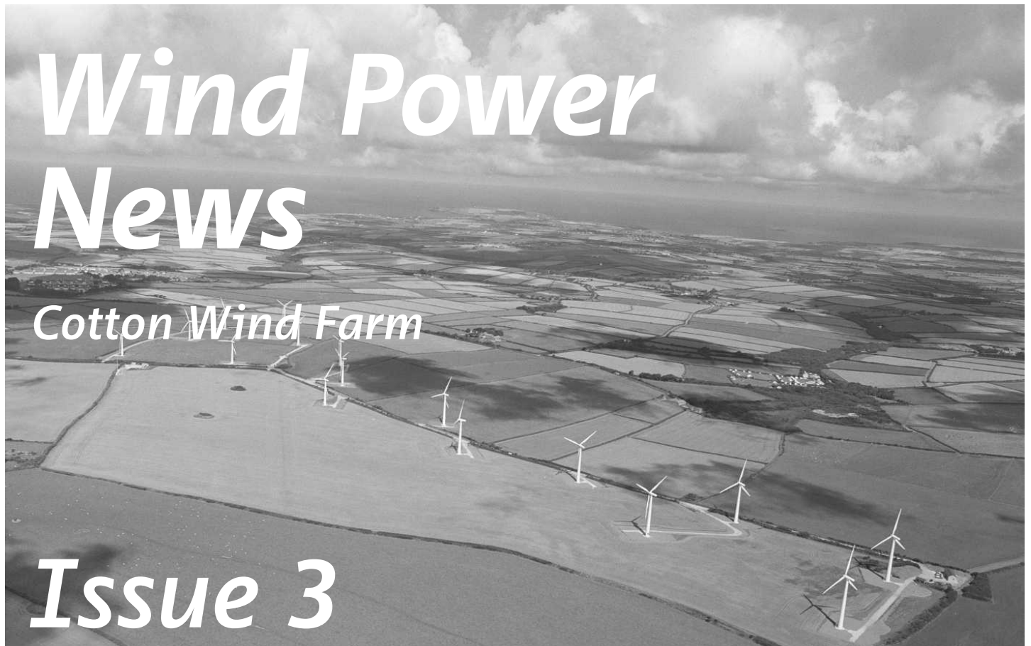
Bears Down Wind Farm, Cornwall. This photograph is not intended to represent the appearance of the proposed Cotton Wind Farm.