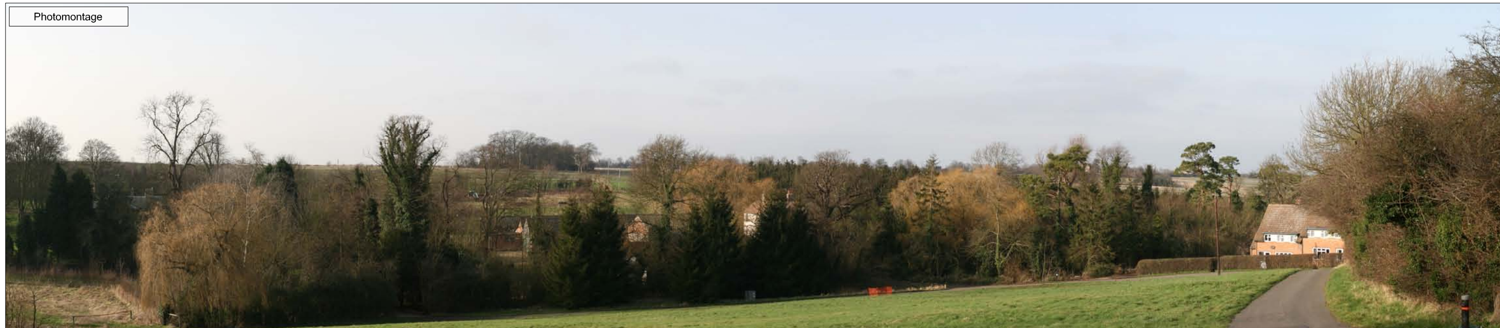
► Papworth Everard - View A