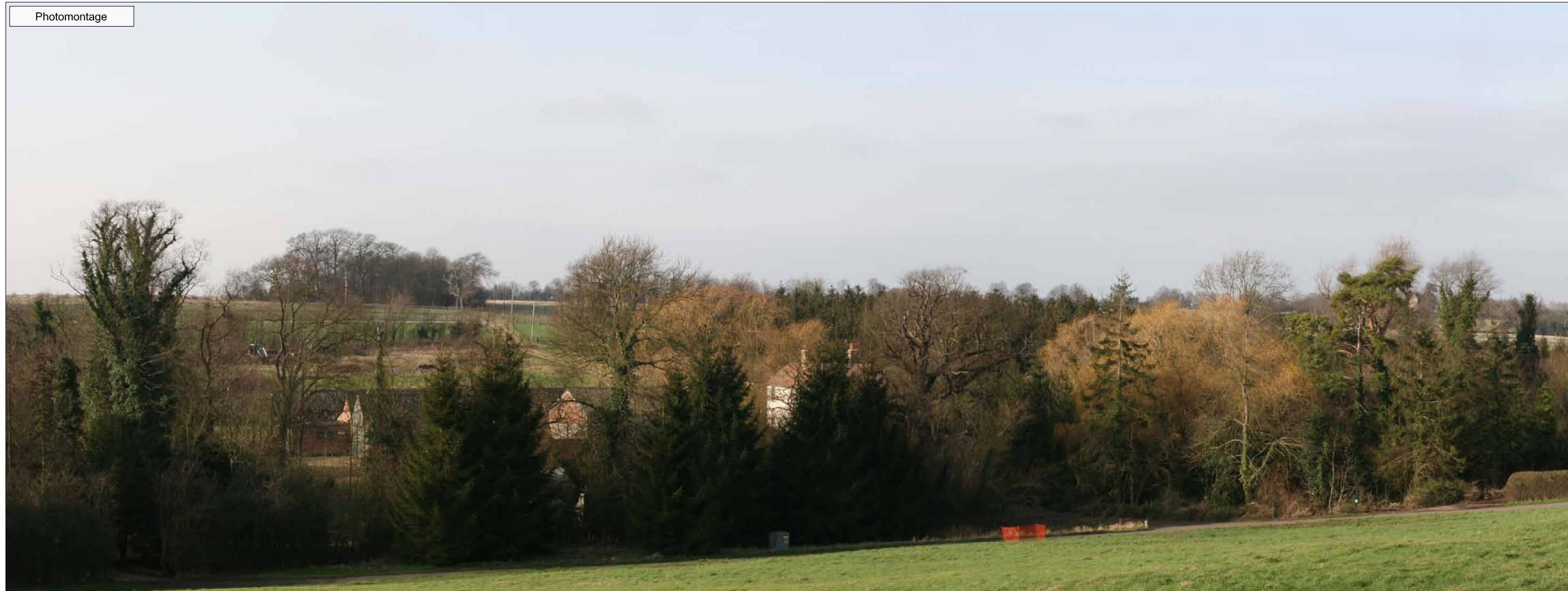
► Papworth Everard - View B