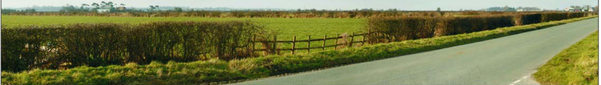
Photomontage of Proposals