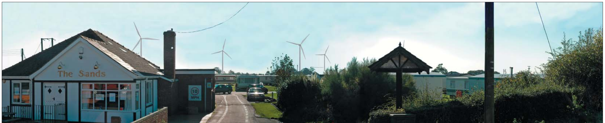
Langham Windfarm - Photomontages Fig. 6.10a: Viewpoint 1b - View from Anderby Creek