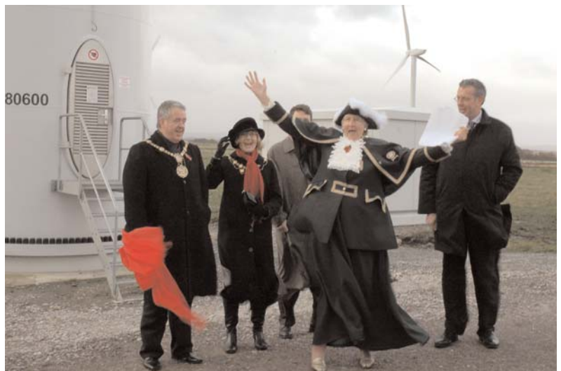
Knabs Ridge Wind Farm Inauguration, November 2008.

The other two members will represent Nidderdale Area of Outstanding National Beauty and Harrogate and Area Council for Voluntary Services.