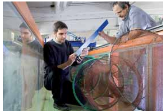
Model tests conducted by RWTH Aachen

An Initiative by the German Federal State of Rhineland Palatinate and RWE Power