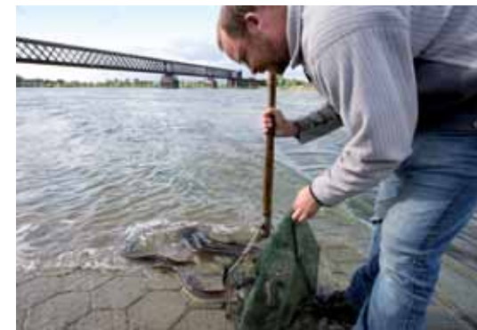
Transporting eels to the Rhine

The Eel Protection Initiative seeks to make an important contribution towards this in the river Moselle.