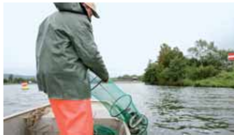
Fishing eels with fish traps

Some of the eels turn around and can use other migration channels (weir, lock) depending on the water discharge. Due to their migratory instinct, they also pass through the turbines to get into the downstream water. As the damage caused by the turbine blades largely depends on the body length of the fish, migrating eels with an average body length of 60 cm are particularly in danger.