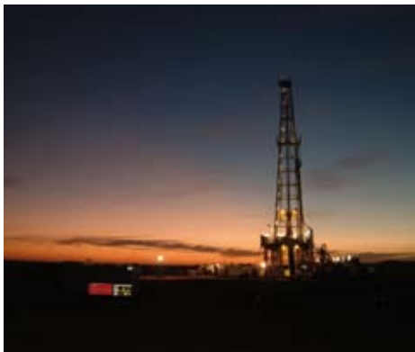
The exploration program of RWE Dea in Libya is highly successful.

The exploration program of RWE Dea in the Libyan Sirte Basin, with four oil strikes to date, is highly successful. After the first two wells drilled in concession NC193 struck oil and another well in concession NC 195 proved successful, the company is now extending its strong position in Libya with a further oil find in the exploration well C1-NC193 within the Hon formation at a depth of 878 meters.