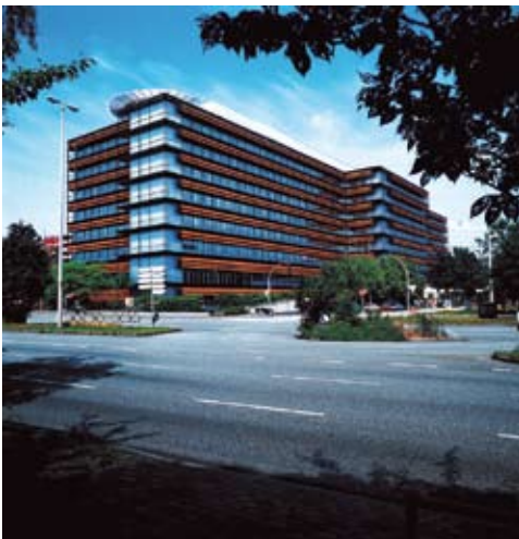
RWE Dea is headquartered in Hamburg, Germany.

In Libya, one of the key regions of RWE Dea’s upstream business, the company has been operating since June 2003. The company’s assets are concentrated in three contract areas: the Sirte Basin, the Cyrenaica Platform and the Kufra Basin. RWE Dea’s licence acreage in Libya covers a total of more than 30,000 square kilometers over six concessions combined, which have been awarded to the company by the Libyan National Oil Corporation in May 2003. RWE Dea is the Operator with a 100% participation interest in these concessions.