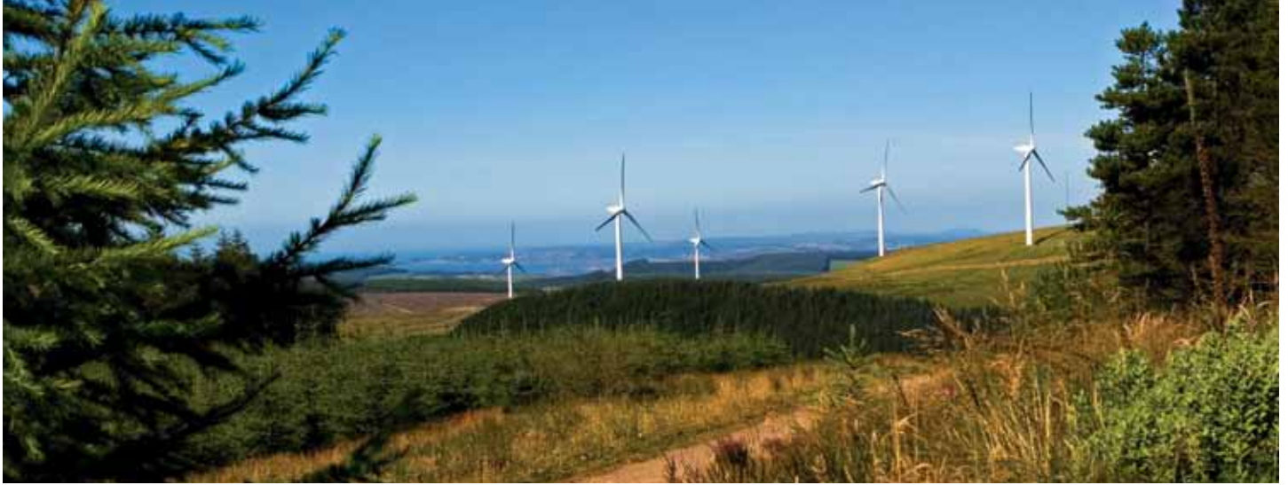
Ffynnon Oer wind farm near Neath, South Wales. Constructed by RWE npower renewables in 2006. Photographs of existing operational wind farms within this newsletter are not intended to represent the appearance of the proposed Brechfa Forest Wind Farm.