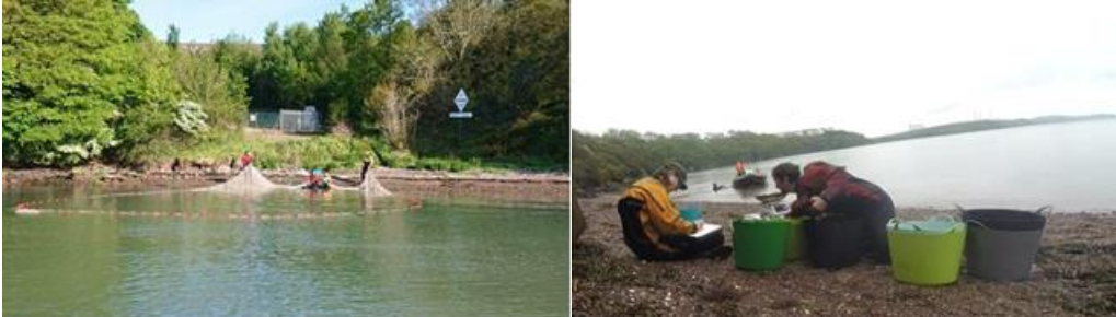
Figure 10 Intertidal surveying around Pembroke Power Station

RWE's hydro and offshore wind projects within Wales have undertaken a range of surveys, details of which have been previously given, the results of which have been shared with regulators. This also enables RWE to enhance its understanding of biodiversity needs on its operational sites.