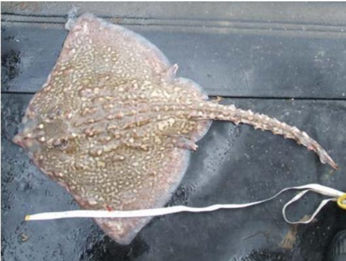
Figure 3 A female Thornback Ray (Raja clavate) caught during pre-construction surveys. The fish is measured, sexed and returned to the sea as soon as possible to maximise survival rates

proportion of fish species), the most vulnerable taxa is elasmobranchs (cartilaginous fish such as sharks, rays and skates). Therefore, selective commercial fishing techniques including beam trawls and tangle nets were used to target elasmobranch populations in the vicinity of the wind farm at pre-construction (2011) and post-construction (2016) phases. A commonly caught species in both surveys was the Thornback Ray (see below), which are known to respond to EMF.