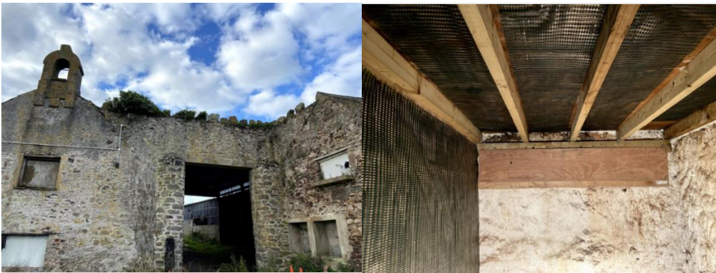
Figure 5 Greenhill Farm Barn and constructed Bat house.

RWE funded a survey of Greenhill Farm Barn located on RWE owned land outside of the Pembroke power station site. The survey in 2017 provided evidence of bat species including Common Pipistrelle, Long-Eared, Lesser Horseshoe and Soprano Pipistrelle bats. In response to this discovery, we worked alongside the Bat Conservation Trust to convert the abandoned barn into a bat house. The new structure has since provided ideal habitat for bat species and continues to increase the biodiversity both on site and within the surrounding site area.