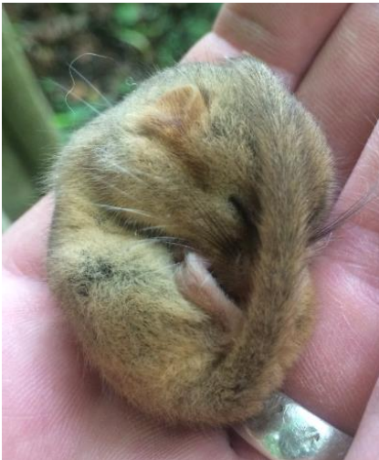
Figure 7 Juvenile torpid dormouse found during monitoring surveys

We created a bat 'hotel' when one of the Dolgarrog valve houses was being renovated. The hotel is situated on the pipeline incline above Dolgarrog village. The bat 'hotel' has separate warm (heated) and cool rooms. Its use has been monitored over a number of years and it is now a major bat roost in the area with a peak of approximately 560 bats being counted during monitoring surveys. Species observed include pipistrelles, lesser horseshoe and some rare long eared bats.