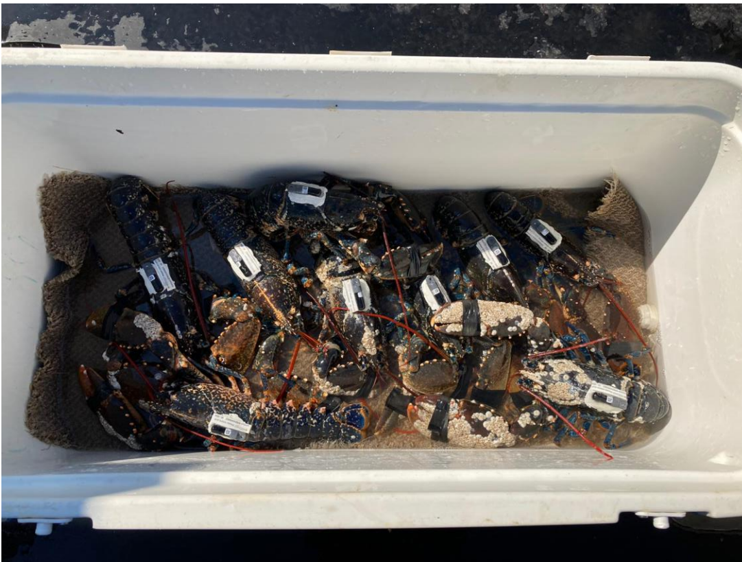
Figure 11 Common lobster (Homarus gammarus) are tagged before release.

RWE's hydro and offshore wind projects within Wales have undertaken a range of surveys, details of which have been previously given, the results of which have been shared with regulators. This also enables RWE to enhance its understanding of biodiversity needs on its operational sites.