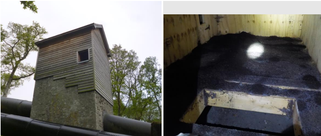
Figure 9 RWE's newly constructed Bat house. Surveys have shown it to be well used.

Biodiversity and the opportunity to improve habitats is considered when planning maintenance works. For example; during routine works clearing dead or fallen trees, brash is not chipped but left in piles to create additional habitat.