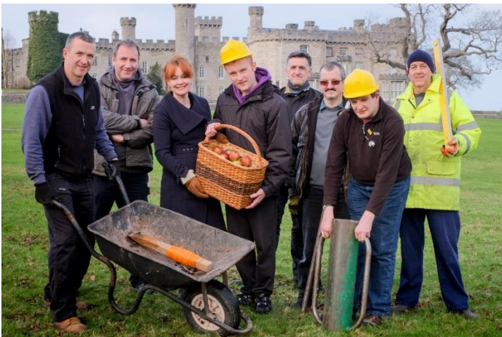
Figure 1 Bodelwyddan Castle Trust- GYMOWFL in partnership to improve castle grounds

GYMOWF worked closely with Bodelwyddan Castle Trust, a charitable trust that maintained the castle grounds through conservation, education and social inclusion. The partnered project in 2015 focused on creating a parkland orchard, through planting trees and putting up information boards around the site. This project, alongside others that GYMOWF have assisted with, help to bring people together to establish a sense of community all whilst working towards long term sustainability.