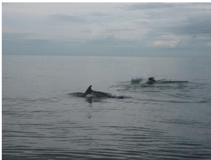
Figure 6 Example of bottlenose dolphins sighting in baseline surveys surrounding the Liverpool Bay