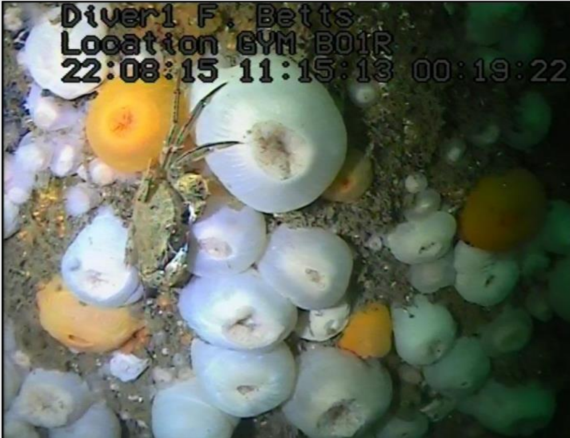
Figure 5 Example monopile colonisation from sessile anemones and mobile species such as the velvet swimming crab ( Necora puber ).