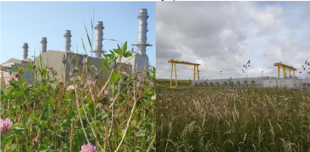
Figure 4 Wildflower Meadow at Pembroke Power Station

Meadows and Marshland can also be found to the west of Pembroke's site. This diverse habitat is home to flora and fauna ranging from Kingfishers, Spotted Redshank to species of Orchid, most notably Bee Orchids. This habitat supports wildlife associated with Wetland habitats which have declined by up to 40% across the UK since the 1930s.