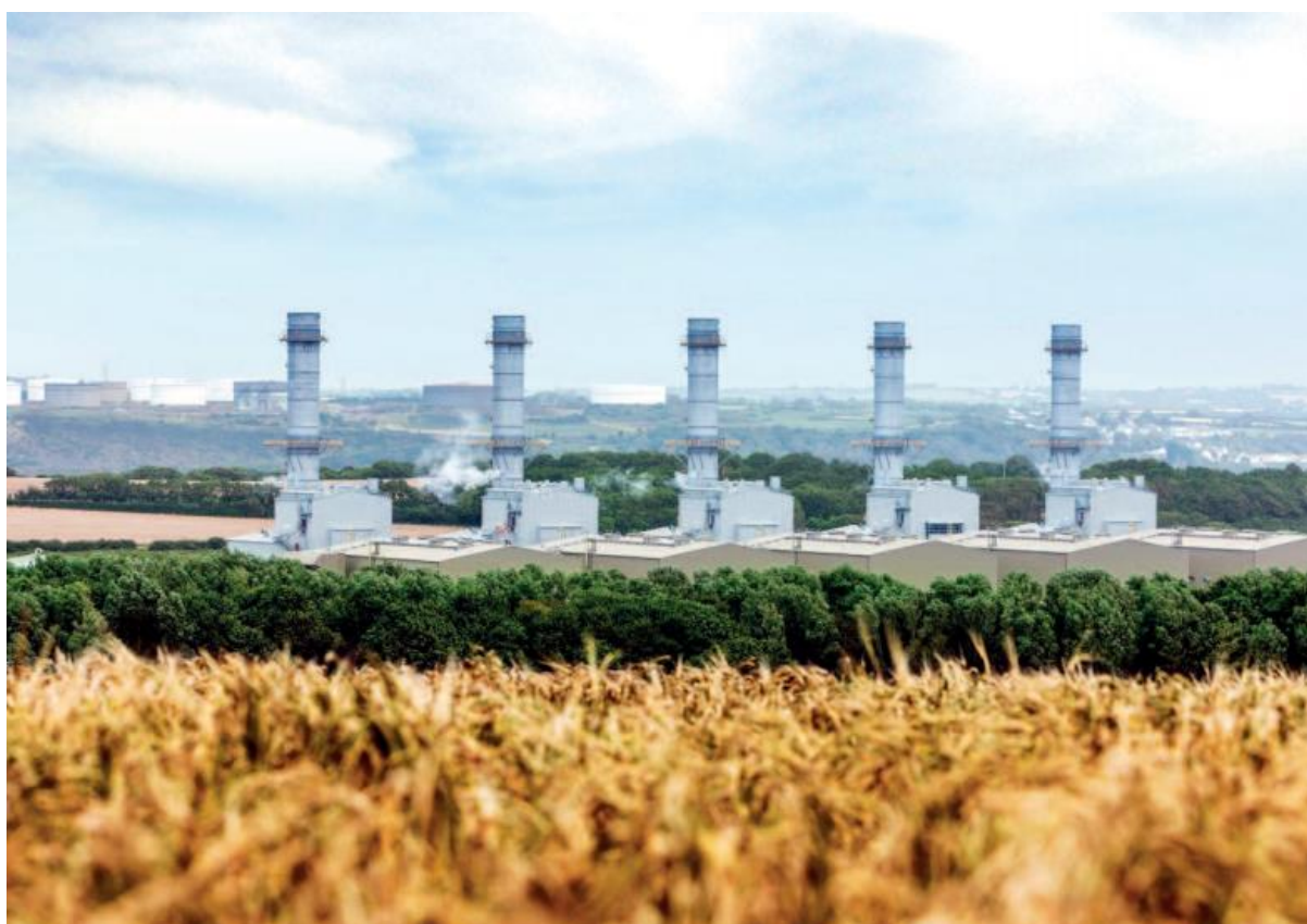
Figure 2 Pembroke Power Station

Pembroke Power Station is committed to increase its site biodiversity. Overall, the site contains six different habitat types which help to support many species, some of which are considered rare. The habitats that can be found at Pembroke include marine, wild-flower grassland, semi-natural ancient woodland, artificial cliff habitats and marshland. A terrestrial survey was undertaken during the consenting of the power station (the last survey year was 2006). There were no plant species listed in the survey that are included