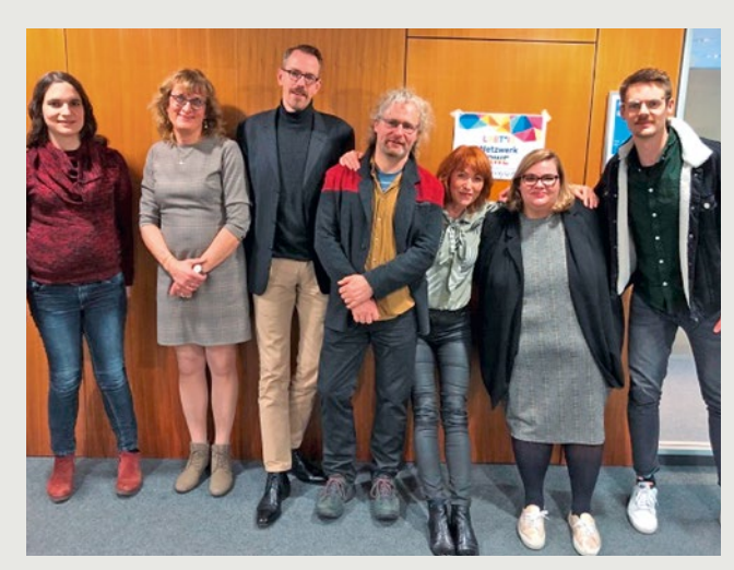
Kick-off of the LGBT*IQ & Friends working group in Essen, November 2019