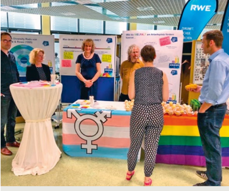
Booth at the RWE Diversity Day, May 2019 at the power plant Niederaußem