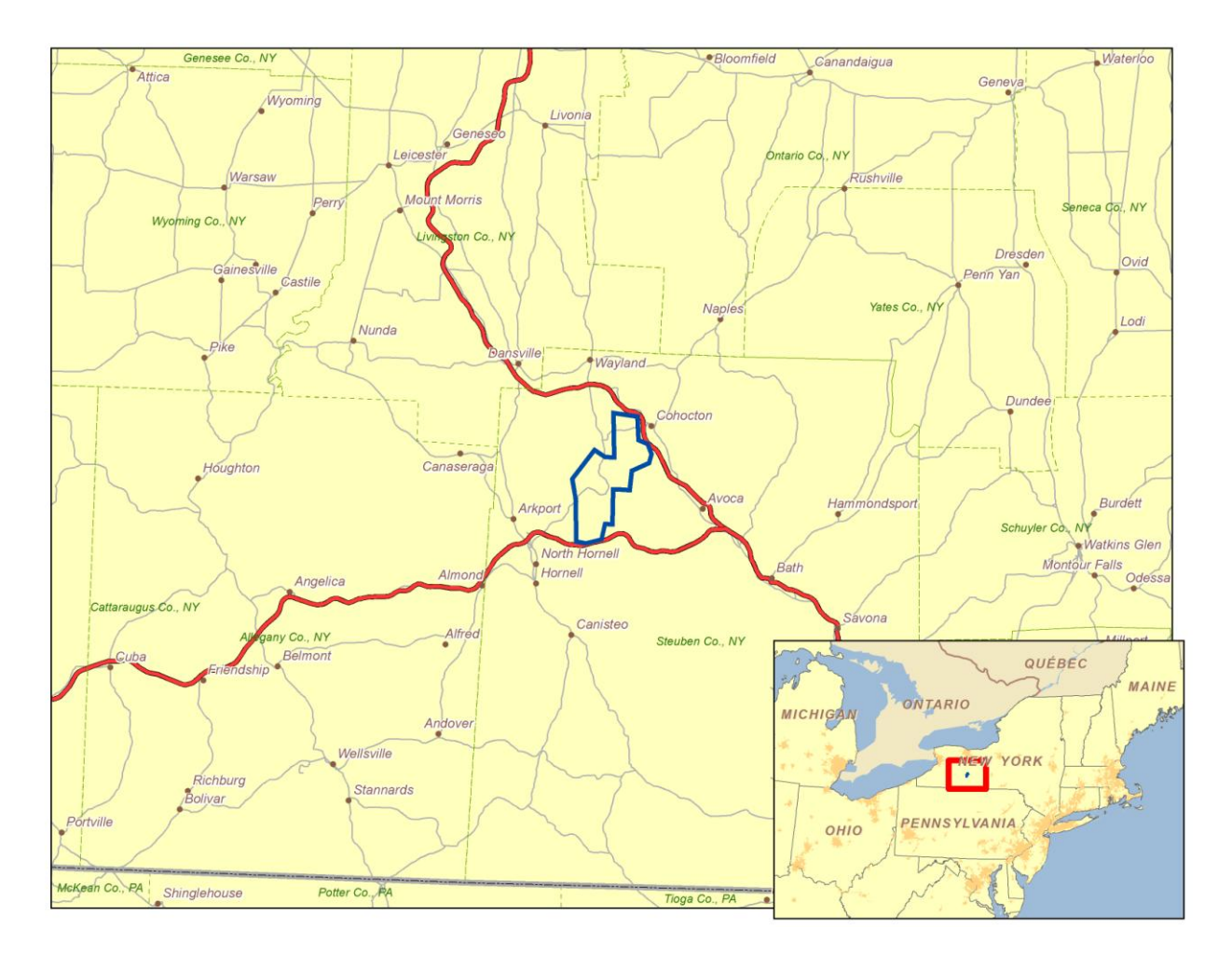
Figure 1: Counties that intersect the Area of Interest

Our mobile phone analysis was performed using Comsearch's proprietary carrier database, which is derived from a variety of sources including the Federal Communications Commission (FCC). Since mobile phone market boundaries differ from service to service, we disaggregated the carriers' licensed areas down to the county level. Then we compiled a list of all mobile phone carriers in the main counties that intersect the area of interest. The area of interest was defined by the client and encompasses the planned turbine locations. A depiction of the wind project area and counties appears below.