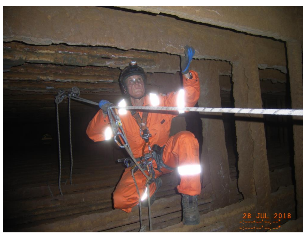
Sampling in the power plant boiler

Investigation of deposit formation by mineral components contained in fuels. Samples are examined in the Mineralogical Laboratory.